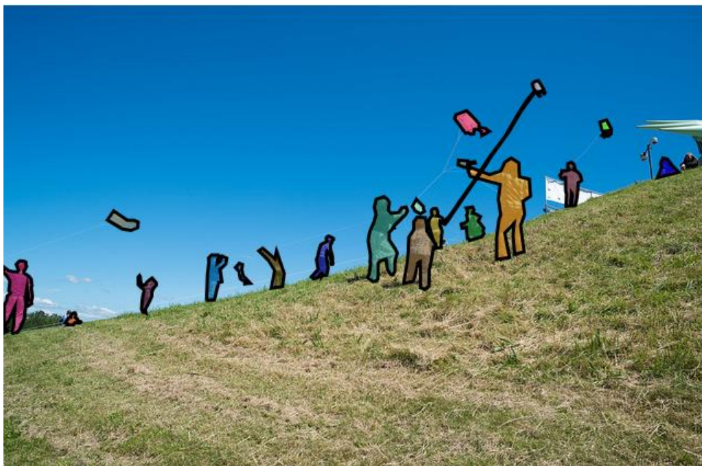
Source: MS COCO dataset

Department of Computer Science and Information Engineering, National Taiwan Normal University